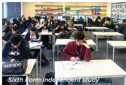
Sixth Form independent study

study a wide range of subjects and our students have made a great start to this academic year. They apply themselves really well to their independent learning, helping them to improve their knowledge, skills and academic performance.