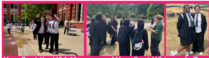
Year 7s at the V&A Museum and Year 8s at Whipsnade Zoo