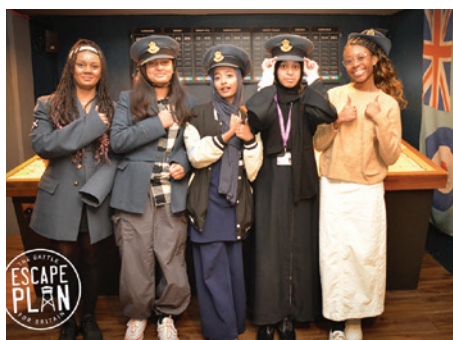
Year 12 Enrichment afternoon at the Escape room!

Well done to the 19 girls who visited Amazon HQ on Thursday for Global Girl Leading, marking International Women's Day 2025! They made a fantastic impression, engaging with inspiring women, including the EU marketing lead for TikTok, BA pilots, a