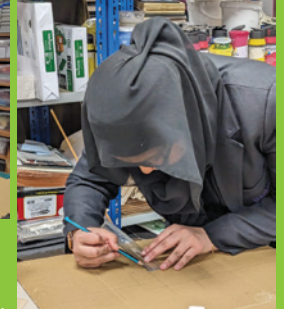
Students working hard on their projects in an environmental activism workshop with Coney and Greenpeace (more next week)

Your child is due to receive their HPV vaccination, which will be given in school on Monday 22nd April 2024 Please complete the form by following this link, even if you wish to refuse.