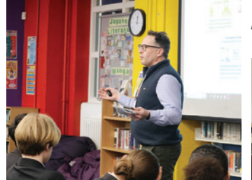
You can listen to Jason's interesting podcasts at: www.man.com/jmitchell