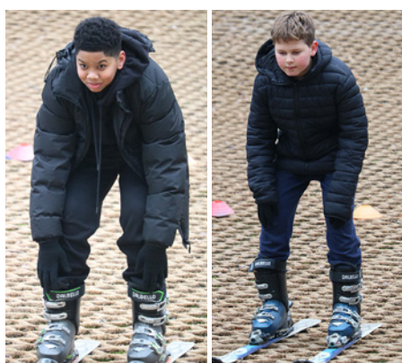
Some of our Year 7s had a session on the dry slope in preparation for the ski slopes in Italy!