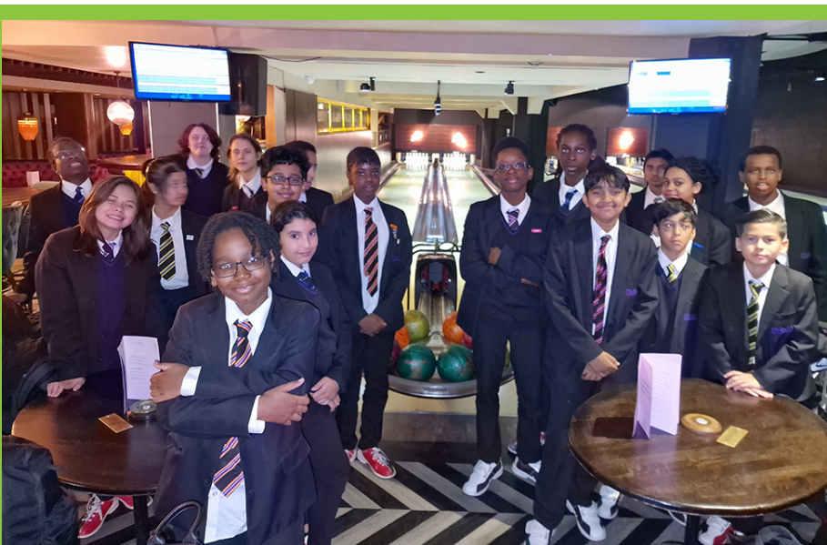
Year 8 students enjoyed bowling - their reward trip for this half term!

If you would like your child to receive the flu spray /vaccination, can you complete the online consent form. https://london.schoolvaccination.uk/flu/2023/towerhamlets