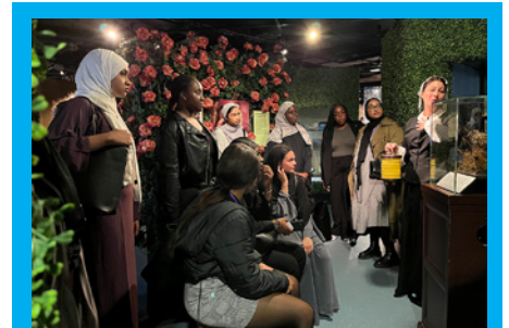
Year 12 students went to the Florence Nightingale museum as part of their Health and Social Care Insights enrichment.

homes across East and North London. We received some fantastic feedback from placements who were impressed with the level of professionalism and commitment displayed by our students at MAS. Our students thoroughly enjoyed this expressed and gained skills and knowledge which will support them in writing up their coursework'