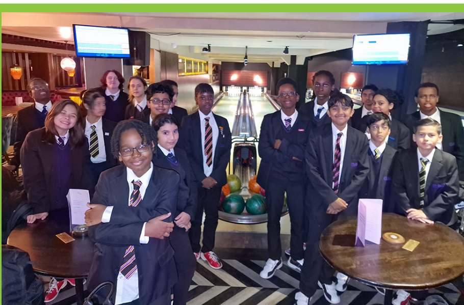
Year 8 students enjoyed bowling - their reward trip for this half term!

If you would like your child to receive the flu spray /vaccination, can you complete the online consent form. https://london.schoolvaccination.uk/flu/2023/towerhamlets