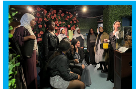
Year 12 students went to the Florence Nightingale museum as part of their Health and Social Care Insights enrichment.

homes across East and North London. We received some fantastic feedback from placements who were impressed with the level of professionalism and commitment displayed by our students at MAS. Our students thoroughly enjoyed this expressed and gained skills and knowledge which will support them in writing up their coursework'