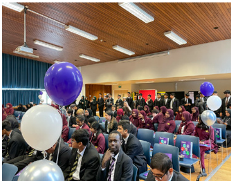
The new Year 9 Societies students at their launch event this week. More inside...