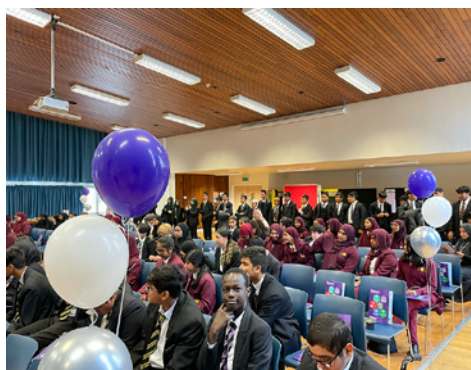
The new Year 9 Societies students at their launch event this week. More inside...