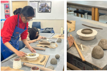
Year 12 art students have been developing hand building techniques in ceramics during their lessons this week.