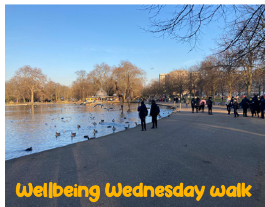
Wellbeing Wednesday walk