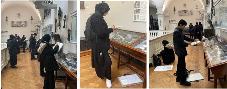
GCSE Art students spent Friday at the V&A drawing and researching for their exam project on the theme 'Lock'.